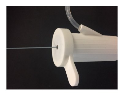
Figure 3. Cannula with Guide (Cap and Guidewire)

MCAUTION: Ensure cannula cap is fully attached to the cannula handle – failure to fully attach cap may reduce functionality of the cannula cap.